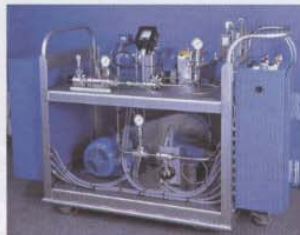
Figure 3: Dual feed system for silicone oil emulsions.

The dual-feed scenario (Figure 3) in which an oil phase and water phase are metered together in a balanced manner, with the pigment dispersion