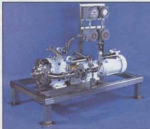
Figure 2: Fumed silica dispersions; Resin manufacturers need a better way to disperse fumed silica into their resin systems as a thickening and anti-sag agent. The Sonolator provided better dispersion, smaller particles sizes and tighter particle size distribution at less than 500psi.

Sonolator tends to deaerate liquid systems. On pigments being wetted out, adsorbed air on pigment surfaces is desorbed and surfaces are wetted rapidly and completely.